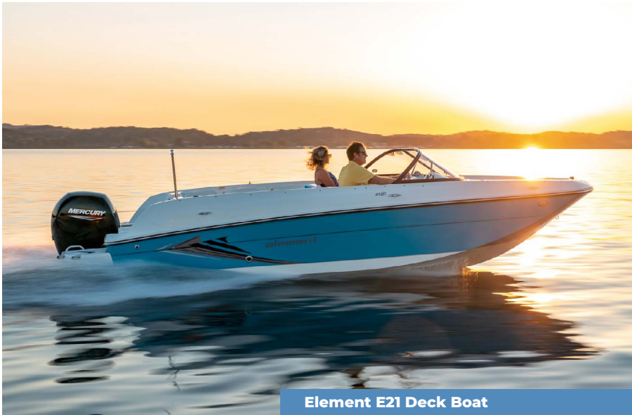
Element E21 Deck Boat