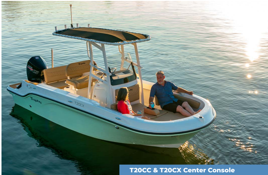
T20CC & T20CX Center Console